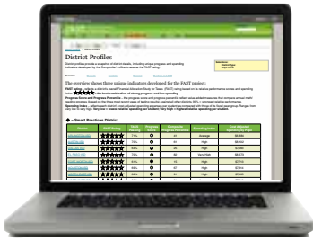
FAST WEB REPORTING TOOL

To provide the public and policymakers with an easy and effective way to compare school district and campus academic achievement, expenditures and resource allocation, the Comptroller's office has developed a FAST website at www.FASTexas.org that allows visitors to run custom reports on school academic and spending information. Users can run reports, view extensive data sets and download the results.